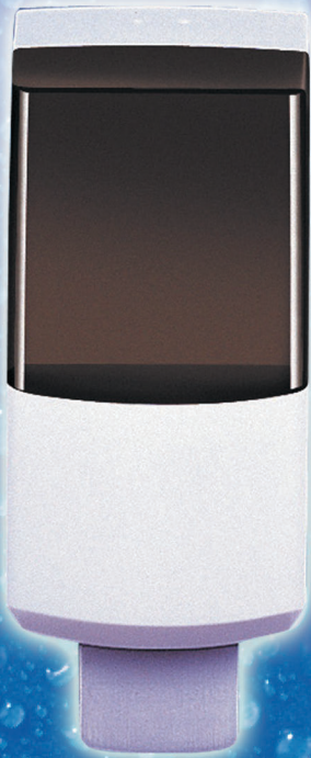
INDUSTRIAL SOAP DISPENSER