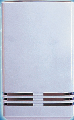
SLIMLINE AIR FRESHENER